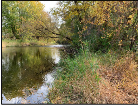
Vermillion River Greenway